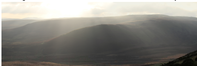
Looking over the Rhos to Esgair Nefal and Lan Fawr

Acquired by the National Trust in 1984, Abergwesyn Commons is 6,667 Ha (16,500 acres) of open access upland habitat situated between the village of Llanwrthwl to the East and the Irfon Valley in the West. In all there are seven contiguous Commons, the boundaries of which are marked by nothing more than features in the landscape such as streams or ancient cairns. This seamlessly flowing area of rolling hills has “wilderness” qualities that seldom occur elsewhere in England and Wales.