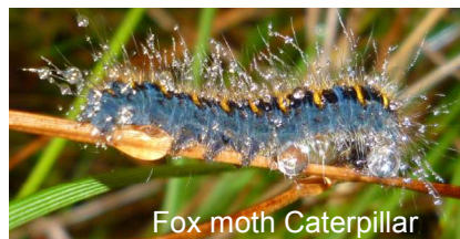
Fox moth Caterpillar

Much of this upland is rich in upland flora. Swards of heather and bilberry cover much of the dry heath and parts of the blanket bog. On the wetter peat bog areas sphagnum thrives along with cotton grass, wild cranberry, bog asphodel, the beautiful modest sundew and various other plants that can survive the harsh conditions of the acid soils.