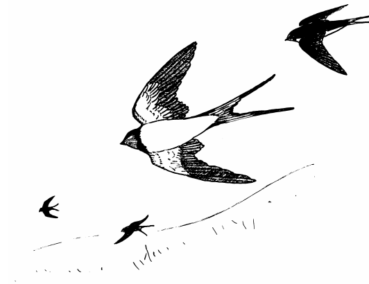
Swallows by Pam Knight

Follow this lane, listening out for the occasional vehicle. The lane may be muddy in places but not so much that the walker cannot appreciate the extensive views to the left and right. The rounded hill to your left (around which the lane circles) is known as Castle Hill. There is a good all-round view from the summit (there is a field path not on today's itinerary which passes close to it)