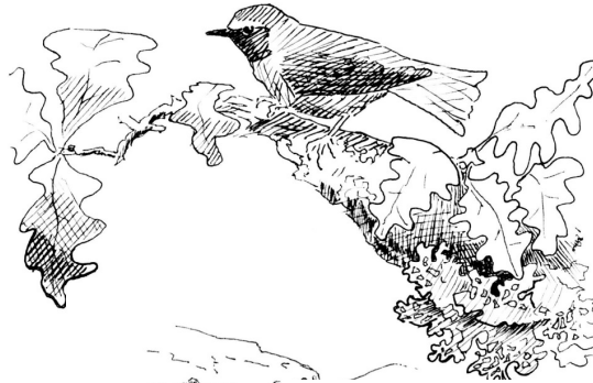
Redstart

From the farm carry on along the lane—at the top of the first hill there is an alternative waymarked footpath—the Wye Valley Walk—but otherwise carry on along the lane.