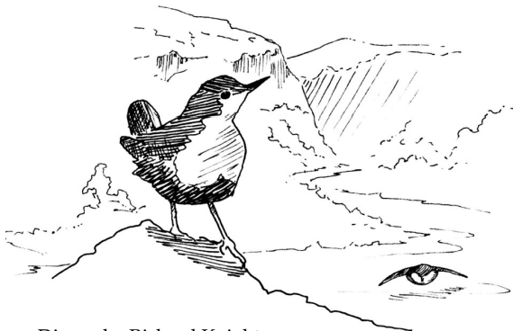
Dipper by Richard Knight

Carry on along this road, it curves around past the old school, now the village community centre (ignore the sign to Penrhos). As it starts to bend up hill, take the way marked footpath on the right and proceed up along this until a lane is joined. Continue right along this lane for about 3/4 mile until just after passing a modernised cottage above the road, where the road in fact bears away up hill to the left, a metal gate will be seen straight ahead.